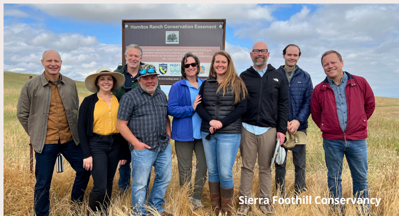
Sierra Foothill Conservancy